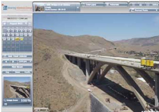
For the NDOT, the cameras on one of the world's longest arch bridges improved trust with stakeholders and increased accountability for the department and contractors.