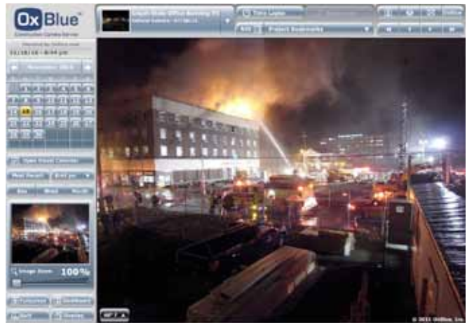
Massaro Corp. was able to validate construction delays; one due to a neighboring building fire which resulted in a portion of that structure landing in the middle of Massaro's jobsite.