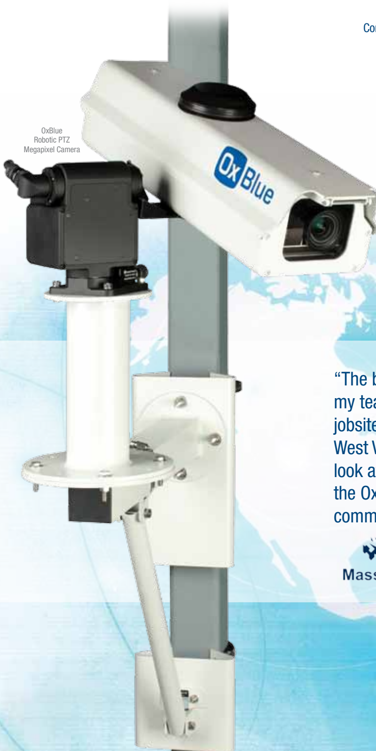
OxBlue Robotic PTZ Megapixel Camera